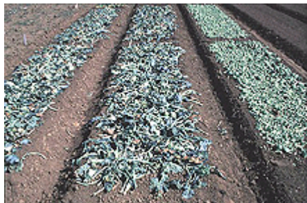
Fig. 3. Placement of broccoli, Brussels sprouts, and horseradish amendments on the soil surface prior to incorporation, Davis, CA, 2001.

A field trial established at Davis, CA in 2001 included: broccoli leaves and stalks at 4.0 tons/ha, tarped and untarped; Brussels sprouts ( B. oleracea L. var. gemmifera ) at 5 tons/ha, tarped and untarped; horseradish mature leaves at 4 tons/ha, tarped and untarped; and tarped and untarped controls. Treatments were replicated four times in a split-plot design. The plant material was placed on top of the beds (Fig. 3) and incorporated to approximately 10 cm. After incorporation, sachets of the citrus nematode and F. oxysporum f. sp. dianthi were inset to various depths as