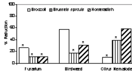
Fig. 6. Effect of brassicaceous amendment on percent reduction of Fusarium spp., bindweed and citrus nematode at 30 cm during 2001, Davis, CA. Percent reduction is expressed as a percentage of the untarped control. Each bar is the mean of four replications. Reduction in pest survival between treatments was significantly different for bindweed ( P < 0.05 ) and the citrus nematode ( P < 0.01 ), but not for Fusarium spp. ( P < 0.10 ). A star above a bar indicates lack of difference with the untarped control ( P < 0.10 ) according to Tukey's adjustment for multiple comparison test.

We attempted to apply higher concentrations of specific glucosinolates by using other brassicaceous amendments. When target organisms were exposed to other brassicaceous amendments, differences in efficacy were observed. For the citrus nematode at 30 cm, Brussels sprout and horseradish amendments reduced citrus nematode survival 39 and 59%, respectively, compared to the untarped control, while broccoli was ineffective (Fig. 6). This same effect was not observed at 15 cm. The reason for the inconsistency in citrus nematode suppression between depths is unclear. Broccoli was the only brassicaceous amendment which reduced bindweed populations compared to the untarped control (Fig. 6). Weeds other than bindweed were not affected by the type of brassicaceous amendment. There was a non-significant reduction in Fusarium spp. with brassicaceous amendments compared to the uncovered control at 30 cm. There was no difference in Fusarium spp. reduction between amendments. Although Brussels sprouts and broccoli have similar glucosinolate profiles, Brussels sprouts contain larger concentrations of sinigrin (12). Horseradish contains mainly sinigrin (8) but at higher concentrations than the other two amendments. This higher concentration of sinigrin in horseradish may have contributed to the increased reduction in citrus nematode in our field studies.