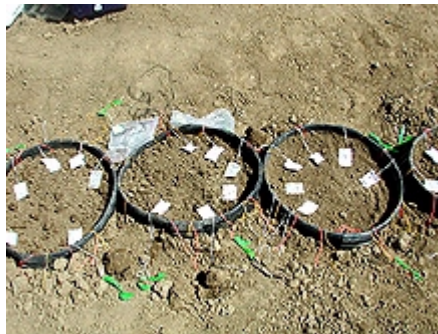
Fig. 1. Example of buried inoculum sachets used in all brassicaceous field and microplot experiments.

Five grams of soil containing mixed stages of the citrus nematode ( Tylenchulus semipenetrans ) or chlamydospores of F. oxysporum f. sp. dianthi were placed in 3.8- \times -7.6-cm, 40-mesh nylon sachets. The sachets were sealed with hot glue and had a length of colored string attached to denote the intended depth of placement in the plot (Fig. 1). When sachets were removed from soil at the end of experiments, those containing nematodes were assayed for survivors within 48 hours of removal. Sachets that originally contained F. oxysporum f. sp. dianthi were air dried, ground, and then serial dilutions were prepared, spread onto petri dishes, and Fusarium spp. survival determined.