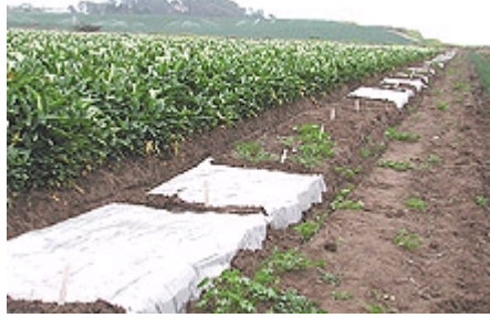
Fig. 2. Field experiment evaluating different rates of broccoli amendments in a calla lily production system, Monterey Bay Academy, CA, 2000.

Field trials were established in a cool, coastal region near the Pacific shoreline at Monterey Bay Academy (MBA), CA. The experimental design and application of amendment material were similar to those described for Watsonville, with the following exceptions. In 1999 the treatments were: broccoli residue at 5.6 tons/ha, tarped and untarped; and metam sodium at 478 kg/ha, tarped. In 2000 the treatments were: broccoli residue at 4 tons/ha, tarped and untarped; broccoli residue at 5.6 and 8.4 tons/ha, tarped; and metam sodium at 478 kg/ha, tarped. Tarped and untarped