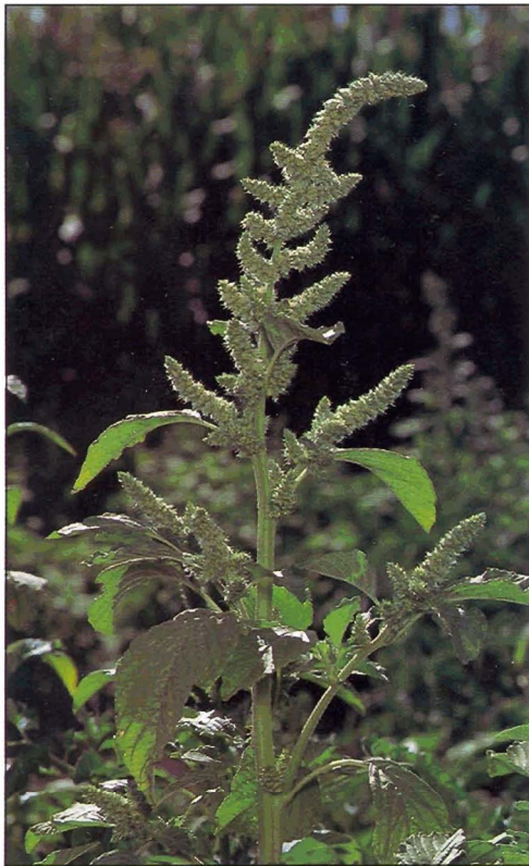
Higher populations of pigweed, a preferred host of the armyworm, seemed to aggravate pest problems for the organic tomatoes.

tor setup used varied according to the crop. In processing tomatoes, cultivation was done using a pair of disks, each set within 2 inches of the tomato seedline followed by L-shaped weed knives to clean the sides of the beds. Safflower and beans were cultivated using a rolling cultivator (Lilliston),