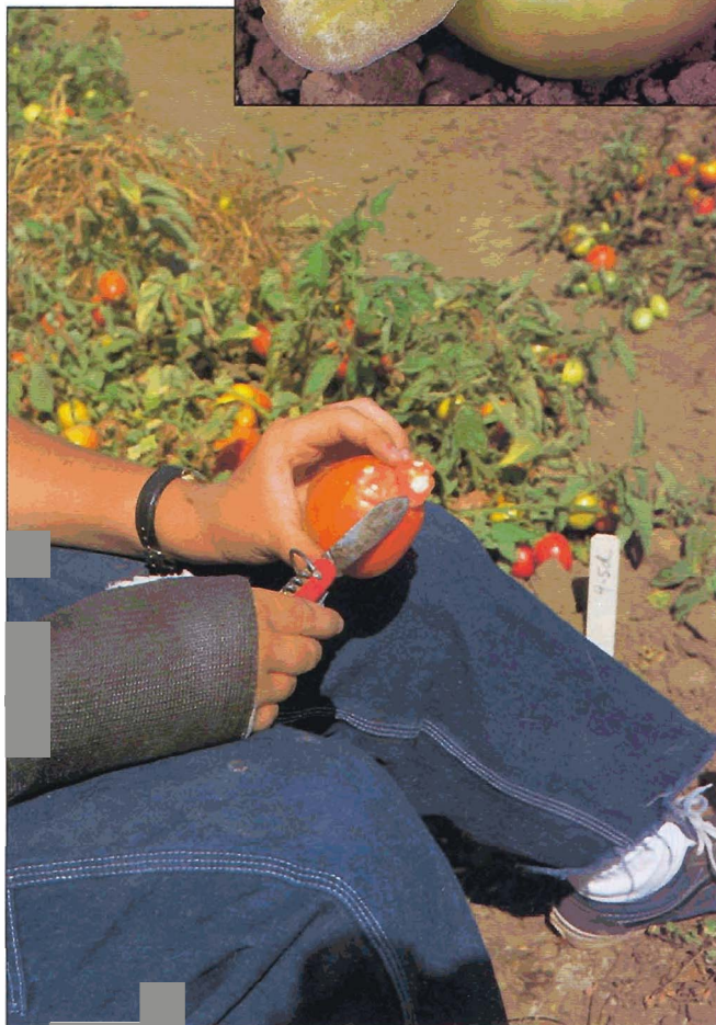
Stink bug damage, the white spots on the tomato shown above, at harvest was much higher in the organic and low-input systems than in either of the conventional systems.

Bacterial spot of processing tomato was severe in the spring of 1993, due to the rain and a hailstorm. Although many growers flew on a control treatment of copper hydroxide (Kocide), we did not because aerial applications to small plots were not practical. By the time the fields had dried sufficiently for a ground application, the weather was hot and dry, stopping the epidemic. No pesticide was applied.